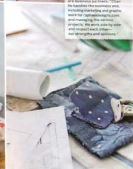
PHOTO: Of the dining room Cerie says, "I love to mix textures and patterns. It gives a piece personality." THIS PAGE, TOP RIGHT: A church window and pew capture the Scandinavian style she loves. BOTTOM RIGHT: Sleep-ins and fabric samples. BOTTOM LEFT: Cerie sees furniture as dress forms and its covering as clothes. DINING CHAIRS: 901154K. BLUE SOFA: CALICO CORNERS. FOR RESOURCES, SEE ADDRESS INDEX.